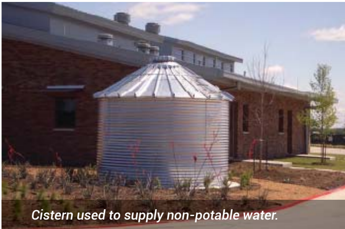
Cistern used to supply non-potable water.