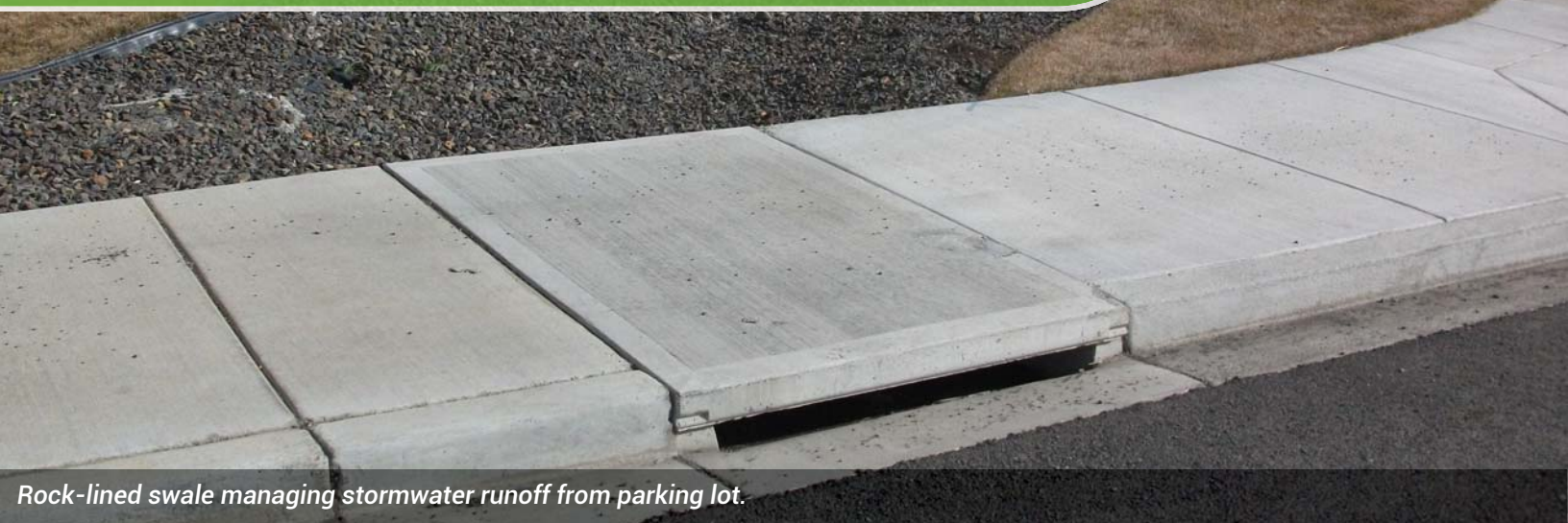
Rock-lined swale managing stormwater runoff from parking lot.